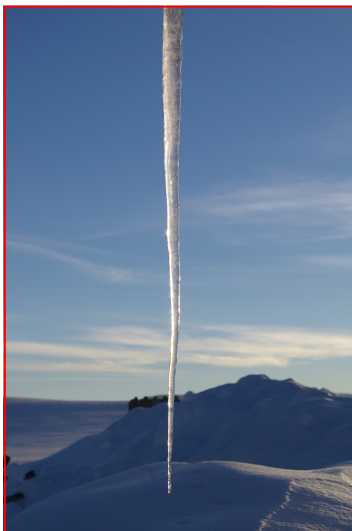
A "little" icicle in Steamboat Springs CO. Winter will soon be gone!